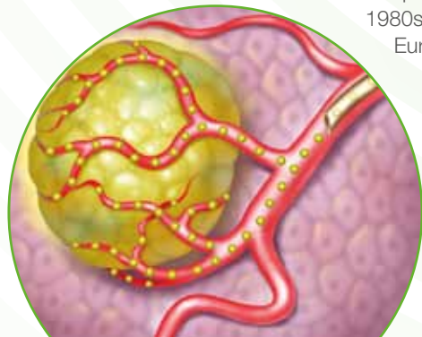
Liver tumours being treated with SIR-Spheres microspheres

SIRT is a targeted treatment for liver tumours that delivers millions of tiny radioactive beads called SIR-Spheres microspheres directly to the liver tumours. The development of SIR-Spheres microspheres started in Australia in the 1980s, with regulatory approval being granted in Europe and the United States in 2002.